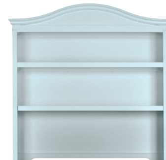
268-0224 ABIGAIL HUTCH 52 1/2W 13 3/4D 51H (133 x 35 x 130 cm)