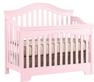
BTG-2000 BUILT TO GROW BRAVO CRIB Overall: 30 11/16W 51 1/2H 58 3/8L (78 x 131 x 148 cm)

The exaggerated shape and size of the traditional antique bail with keepers makes Abigail’s handles easy for even the littlest hands.