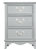
268-0082 ABIGAIL 3 DRAWER NIGHT STAND 21 7/16W 17 1/8D 30 1/4H (54 x 43 x 77 cm)