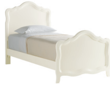
268-0039 ABIGAIL BELCOURT BED, TWIN Overall: 42 5/8W 52 1/8H 78 7/8L (108 x 132 x 200 cm)

CONSISTS OF: 268-0139 ABIGAIL BELCOURT HEADBOARD, TWIN 268-0239 ABIGAIL BELCOURT FOOTBOARD, TWIN RLS-0050 TWIN/FULL BED RAILS SET (HOOK) SLR-0368 SLAT ROLL, TWIN