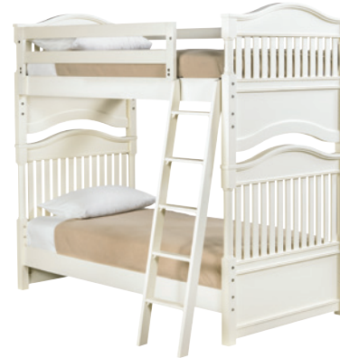
268-7320 ABIGAIL BUNK BED, TWIN Overall: 42 11/16W 75 3/4H 81L (108 x 192 x 206 cm)

CONSISTS OF: 268-E420 ABIGAIL BUNK BED ENDS FULL SET RLS-0052 TWIN/FULL BED RAILS SET (BOLT) SLR-0468 SLAT ROLL, FULL