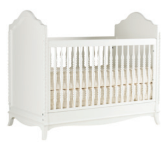
SSC-1300 GRACE CRIB Overall: 31 7/16W 47 1/2H 55 15/16L (80 x 121 x 142 cm)