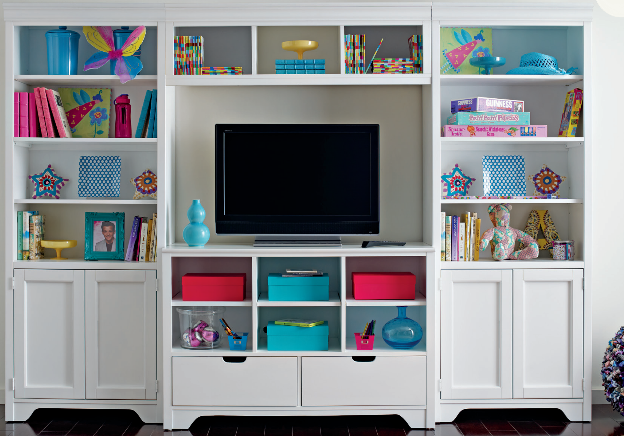
DANA DOOR BOOKCASE (2) WAL-8295-B1 STARLIGHT DANA STORAGE HUTCH WAL-8125-B1 STARLIGHT DANA LARGE CONSOLE WAL-8195-B1 STARLIGHT

The accumulation of stuff – it starts before baby and mom come home from the hospital and never really stops. Give it all a home with our inspired, innovative wall units. Aside from the volumes of storage, you can tuck pieces into the wall units to stay ahead of your child's evolving needs: from a dresser with changing station, to a single bed, to a desk and chair perfectly sized for late-night study sessions. Every year, more new stuff. We're ready.