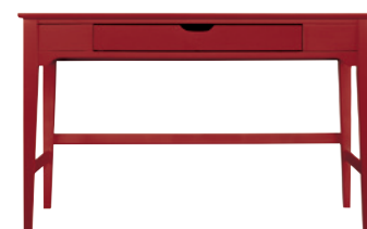
WAL-8226 DANA WRITING DESK 49W 22 3/16D 30 3/16H (124 x 56 x 77 cm)