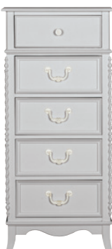
268-0011 ABIGAIL SINGLE CHEST 21 7/16W 20 3/4D 46 13/16H (54 x 53 x 119 cm)