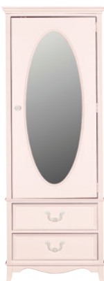
268-0015 ABIGAIL WARDROBE 28W 20 1/4D 73 7/8H (71 x 51 x 188 cm)