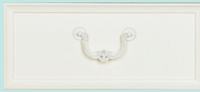
STANDARD PAINT TECHNIQUE

We craft Abigail to last from kiln-dried North America hardwoods and maple veneers. Our new finish palette is just as attentive to longevity, offering a range of classic wood tone and paint selections. On painted items, an optional hand-weathered effect combined with the artful application of contrasting tints projects a sophisticated appearance. Lived-in charm from the day it arrives.