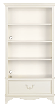
268-0013 ABIGAIL BOOKCASE 30 9/16W 17 3/8D 59 1/4H (78 x 44 x 150 cm)