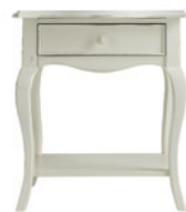
268-0080 ABIGAIL 1 DRAWER NIGHT TABLE 22 15/16W 18D 26H (58 x 46 x 66 cm)