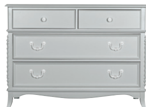
268-0001 ABIGAIL SINGLE DRESSER 45 5/8W 20 3/4D 33 1/16H (116 x 53 x 84 cm)