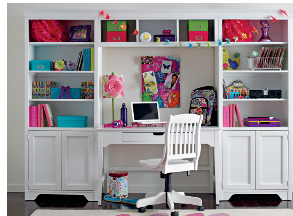
▲ DANA DOOR BOOKCASE (2) WAL-8295-B1 STARLIGHT, DANA STORAGE HUTCH WAL-8125-B1 STARLIGHT DANA WRITING DESK WAL-8226-B1 STARLIGHT, BAILEY BANKER CHAIR CHR-0071-B1 STARLIGHT