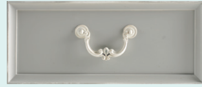
VINTAGE WEATHERED PAINT FINISH WITH ANTIQUE WHITE HARDWARE

The exaggerated shape and size of the traditional antique bail with keepers makes Abigail’s handles easy for even the littlest hands.