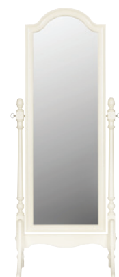
MIR-0033 CHEVAL DRESSING MIRROR Overall: 24 1/4W 20 5/8D 64H (62 x 52 x 163 cm)