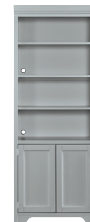
WAL-8295 DANA DOOR BOOKCASE 30W 15 11/16D 78H (76 x 40 x 198 cm)