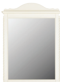
268-0032 ABIGAIL VERTICAL MIRROR Overall: 33 3/8W 3 1/4D 45 1/2H (85 x 8 x 116 cm)