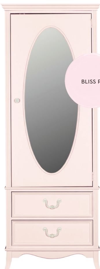
ABIGAIL WARDROBE 268-0015-F1 BLISS