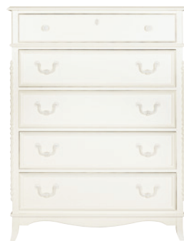
268-0012 ABIGAIL CHEST 38 3/4W 20 3/4D 50 13/16H (98 x 53 x 129 cm)