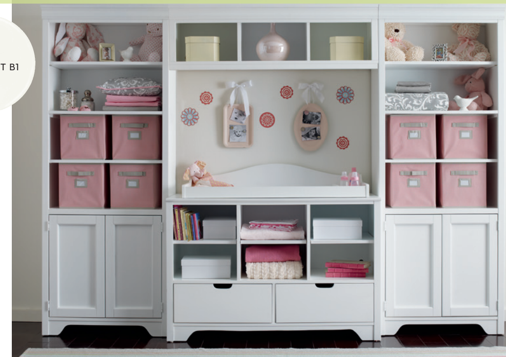
▲ DANA DOOR BOOKCASE (2) WAL-8295-B1 STARLIGHT, DANA STORAGE HUTCH WAL-8125-B1 STARLIGHT DANA LARGE CONSOLE WAL-8195-B1 STARLIGHT, CHANGING STATION CHS-3305-B1 STARLIGHT