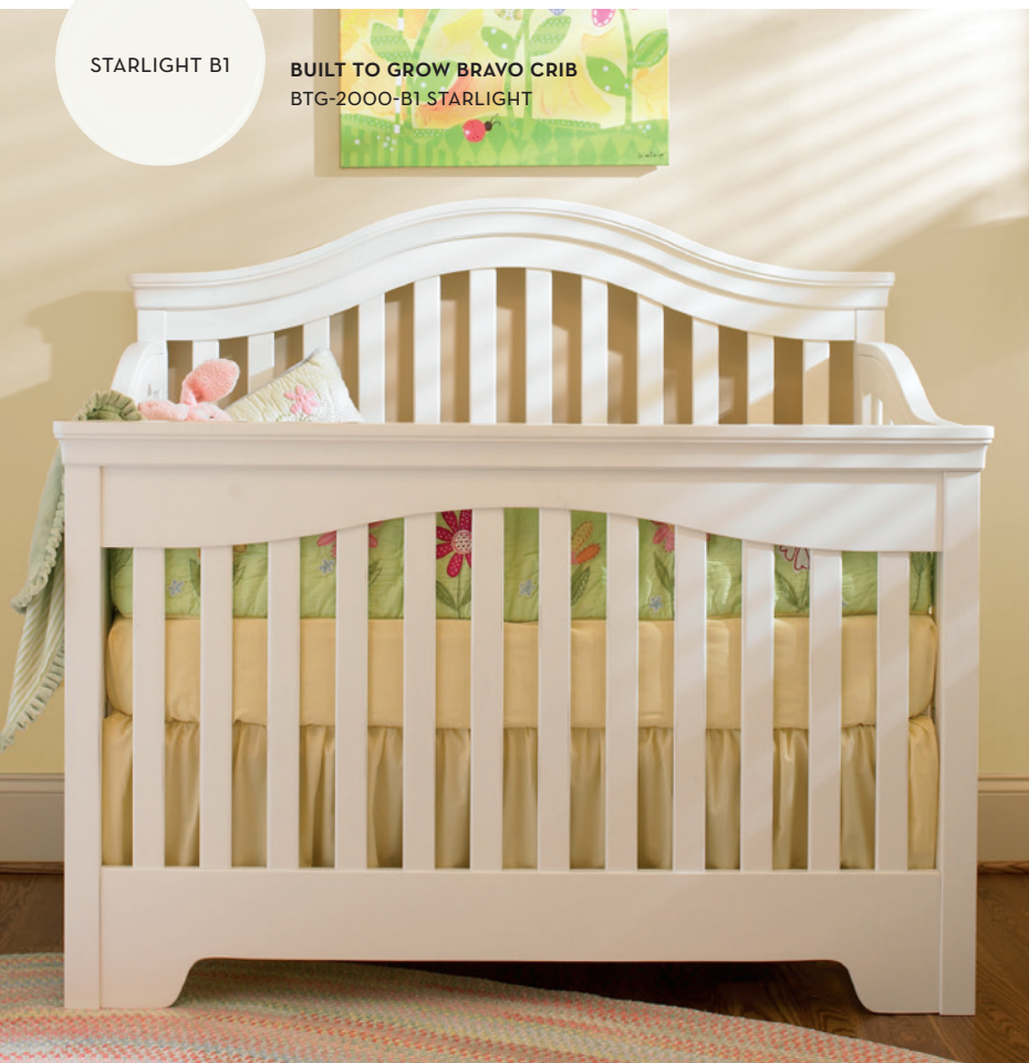
BUILT TO GROW BRAVO CRIB BTG-2000-B1 STARLIGHT

Safety always comes first at Young America where every single crib undergoes the independent, third-party scrutiny of Intertek Check. Their certification is your assurance that Young America is the safest children's furniture you can buy.