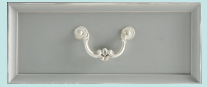
VINTAGE WEATHERED PAINT TECHNIQUE