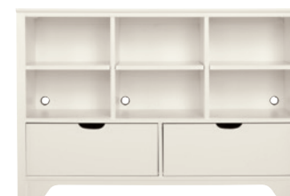
WAL-8195 DANA LARGE CONSOLE 49 1/4W 19 1/8D 33H (125 x 49 x 84 cm)