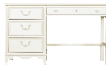
268-0227 ABIGAIL COMPUTER DESK 51 7/16W 23 3/8D 30 1/4H (131 x 59 x 77 cm)