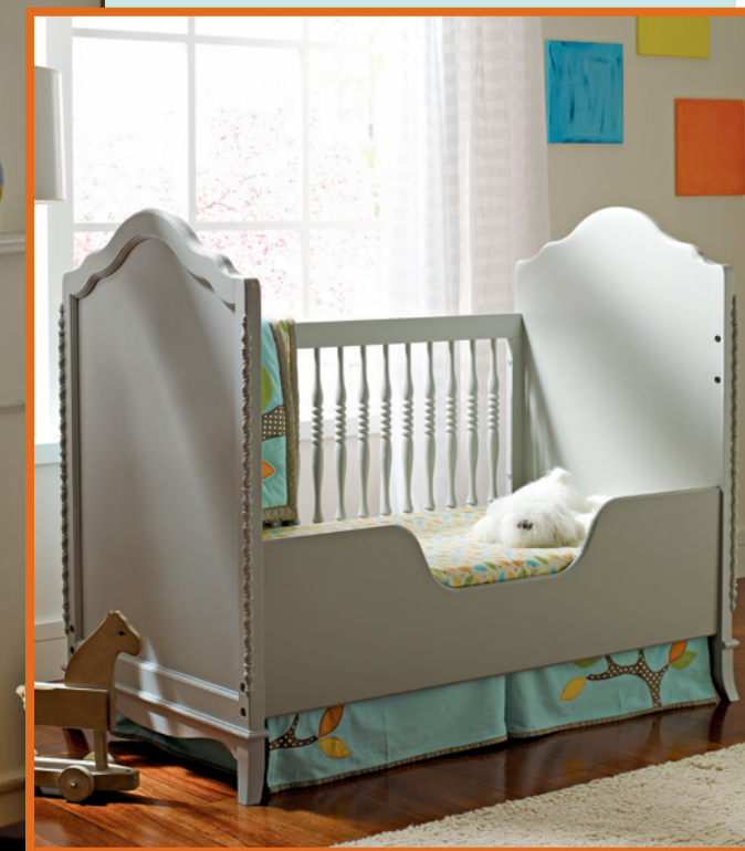
STATIONARY TODDLER RAIL KIT STK-3440-E1 SANDPIPER WEATHERED

Life speeds up when they transition to toddler. Good thing our crib is a quick change artist, converting to a toddler bed faster than you can say "I'm a big girl!"