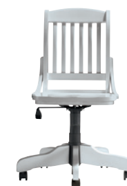
CHR-0071 BAILEY BANKER CHAIR* 17W 19 1/4D 38 1/4H (43 x 49 x 97 cm)