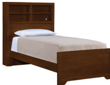
268-0035 ABIGAIL MANOR BED, TWIN Overall: 43 5/8W 52 1/16H 82 3/8L (111 x 132 x 209 cm)

CONSISTS OF: 268-0141 ABIGAIL BELCOURT HEADBOARD, FULL 268-0241 ABIGAIL BELCOURT FOOTBOARD, FULL RLS-0050 TWIN/FULL BED RAILS SET (HOOK) SLR-0468 SLAT ROLL, FULL