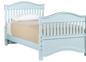
268-7370 ABIGAIL BUNKABLE BED, TWIN Overall: 42 11/16W 43 3/16H 81L (108 x 110 x 206 cm)

CONSISTS OF: HBD-H554 NEWBERRY BOOKCASE HEADBOARD, FULL LPF-3291 LOW PROFILE FOOTBOARD, FULL RLS-0050 TWIN/FULL BED RAILS SET (HOOK) SLR-0468 SLAT ROLL, FULL