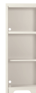
WAL-8255 DANA LOW BOOKCASE 19 3/4W 10D 52H (50 x 25 x 132 cm)