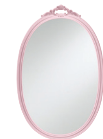
MIR-3180 OLIVIA OVAL MIRROR Overall: 26W 40 3/16H (66 x 102 cm)