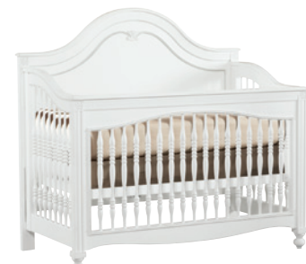
BTG-2800 BUILT TO GROW GALA CRIB Overall: 30 1/2W 53 13/16H 57 1/2L (77 x 137 x 146 cm)

CONSISTS OF: 268-0140 ABIGAIL MANOR HEADBOARD, FULL 268-0240 ABIGAIL MANOR FOOTBOARD, FULL RLS-0050 TWIN/FULL BED RAILS SET (HOOK) SLR-0468 SLAT ROLL, FULL