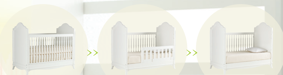
This crib converts to a toddler bed.*

Move over duct tape. Japanese-inspired washi masking tape is the new craft craze. With oodles of color and pattern choices, the possibilities are limitless. You'll love the hands-on fun. Learn how to make your own Washi Tape Art at blog.youngamerica.com .