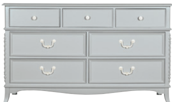
268-0002 ABIGAIL DOUBLE DRESSER 56 1/16W 20 3/4D 33 1/16H (142 x 53 x 84 cm)