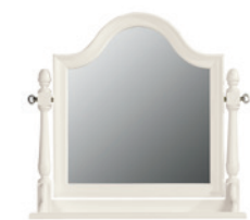
MIR-3155 TABITHA TILT MIRROR Overall: 30 3/8W 5 3/4D 23H (77 x 15 x 58 cm)