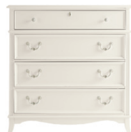
268-0004 ABIGAIL DRESSING CHEST 40 7/8W 20 3/4D 41 15/16H (104 x 53 x 107 cm)